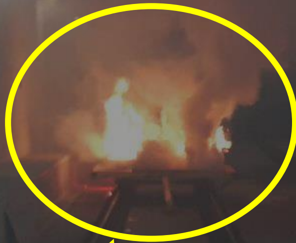
Controlled, hot smoke test