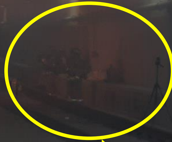
Ottawa Fire Services (OFS) personnel