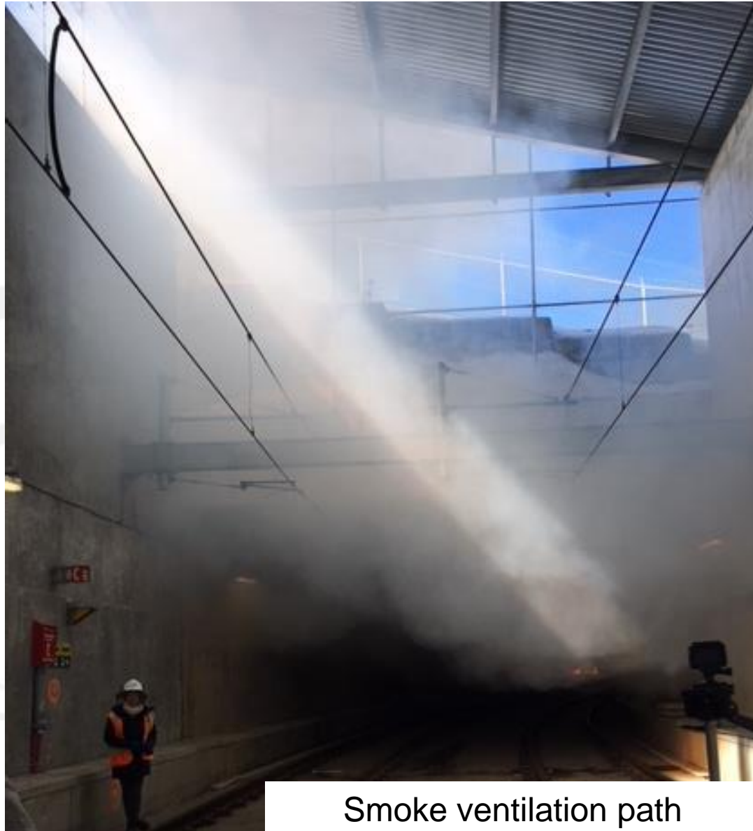
Smoke ventilation path